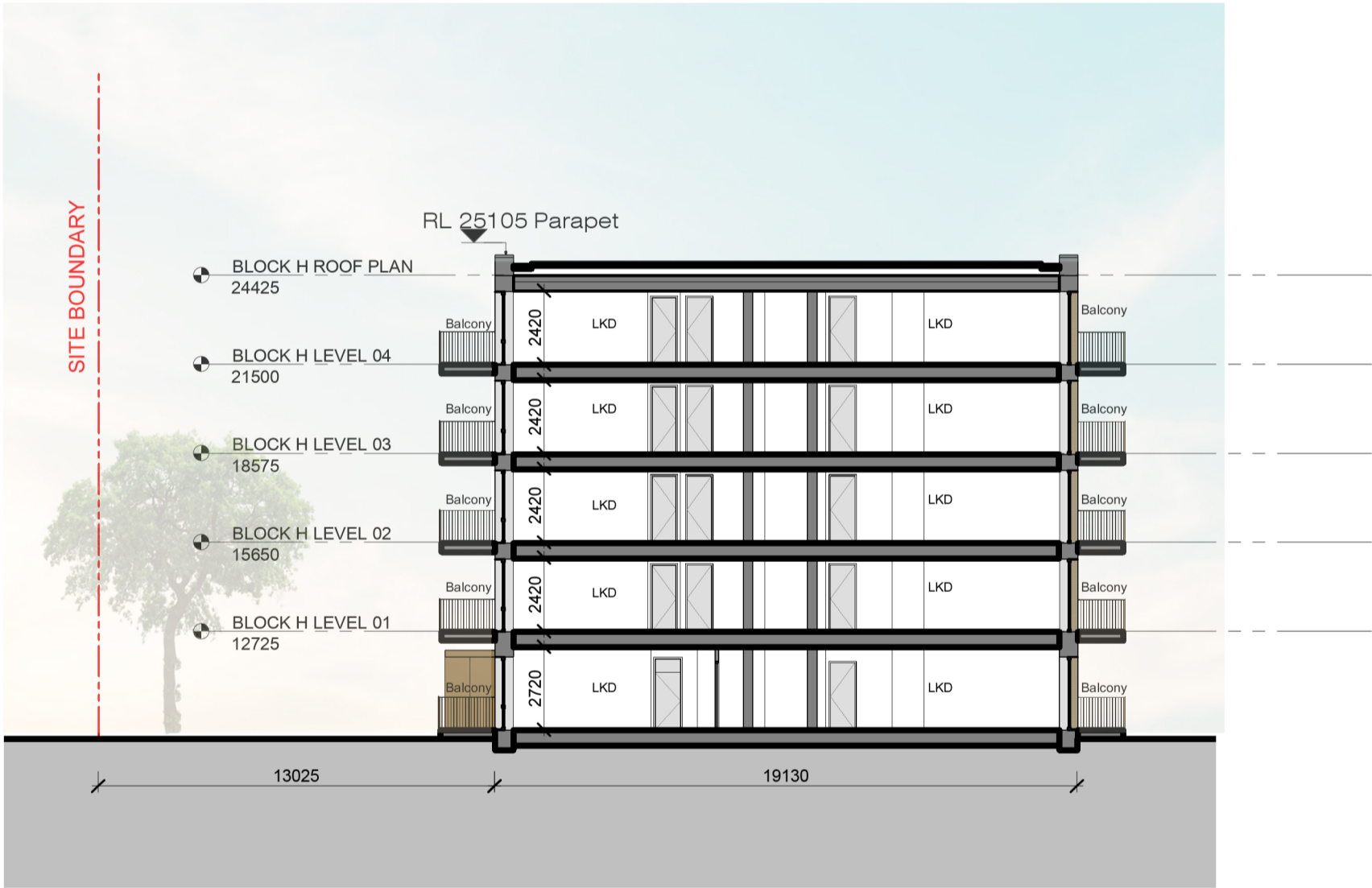
2 Section BB SCALE: 1 : 200

Copyright. All Rights Reserved. This work is copyright and cannot be produced or copied in any form or by any means (graphic, electronic or mechanical including photocopying) without the written permission of the originator. Any license, express or implied, to use this document for any purpose whatsoever is restricted to the terms of the agreement or implied agreement between the originator and the instructing party. Levels and contours are relative to an Ordnance Survey Datum Figured dimensions in millimetres All drawings are to be read in conjunction with Architectural Specification.