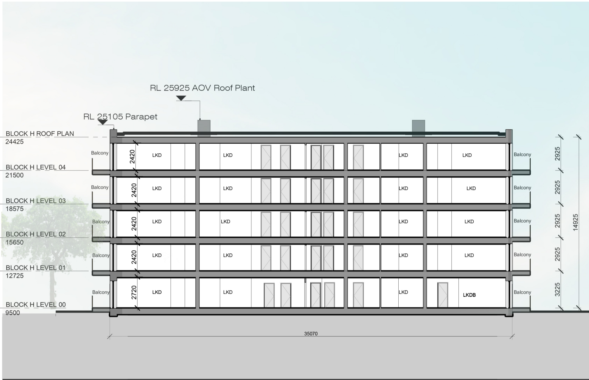
1 Section AA SCALE: 1 : 200