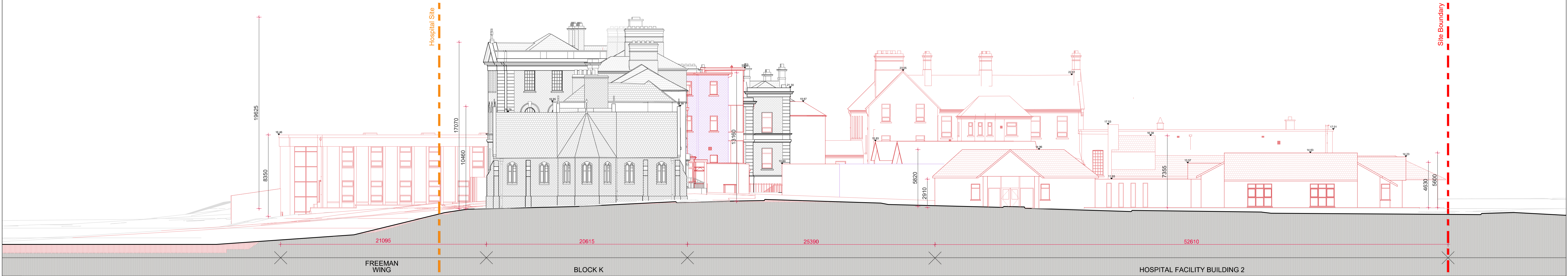
01 East Elevation Demolition SCALE 1:200