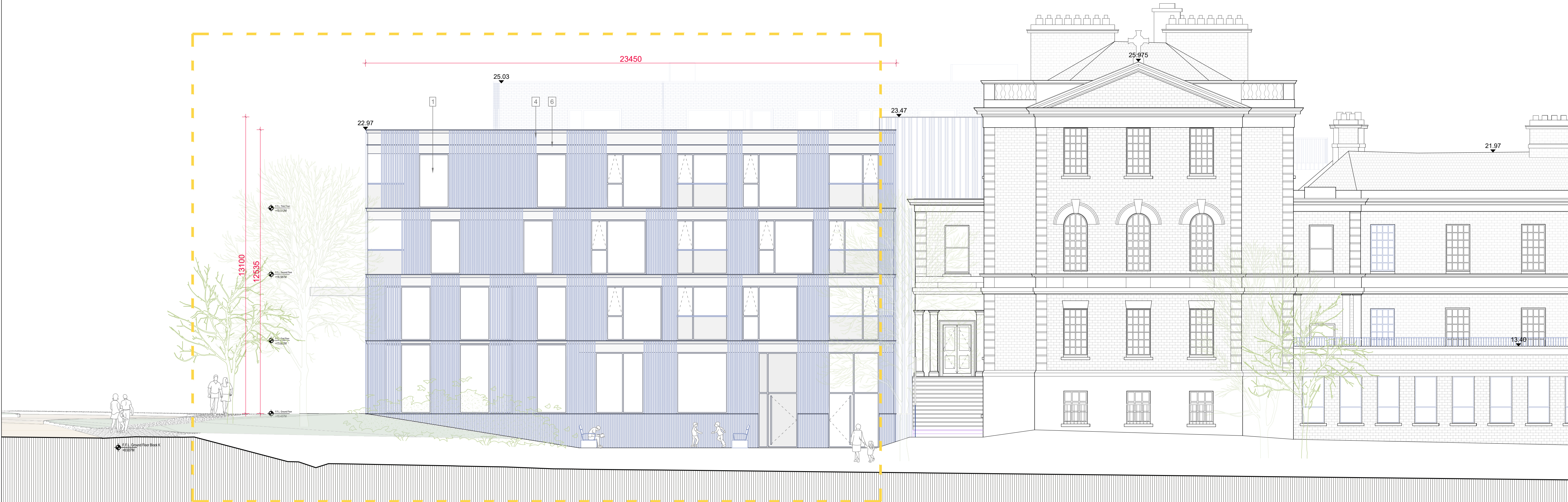
2 South Elevation Proposed SCALE 1:100

Copyright. All Rights Reserved. This work is copyright and cannot be produced or copied in any form or by any means (graphic, electronic or mechanical including photocopying) without the written permission of the originator. Any license, express or implied, to use this document for any purpose whatsoever is restricted to the terms of the agreement or implied agreement between the originator and the instructing party. Levels and contours are relative to an Ordnance Survey Datum Figured dimensions in millimetres. All drawings are to be read in conjunction with Architectural Specification.