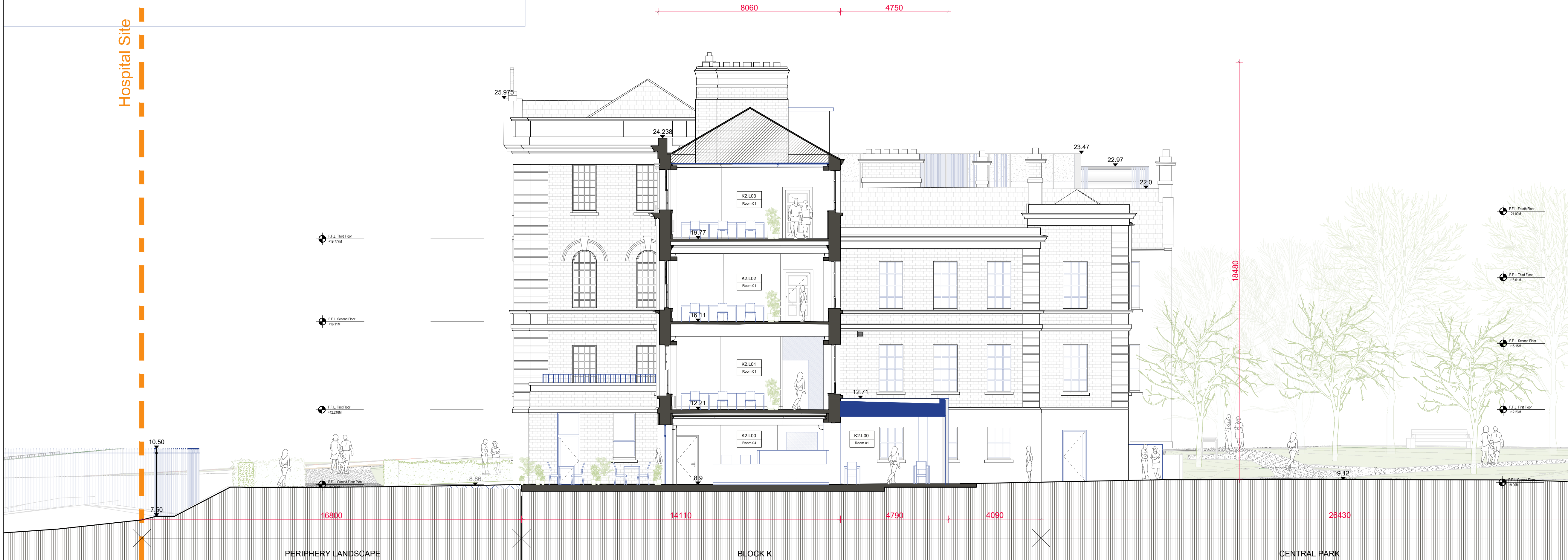
01 Section E Proposed SCALE 1:100