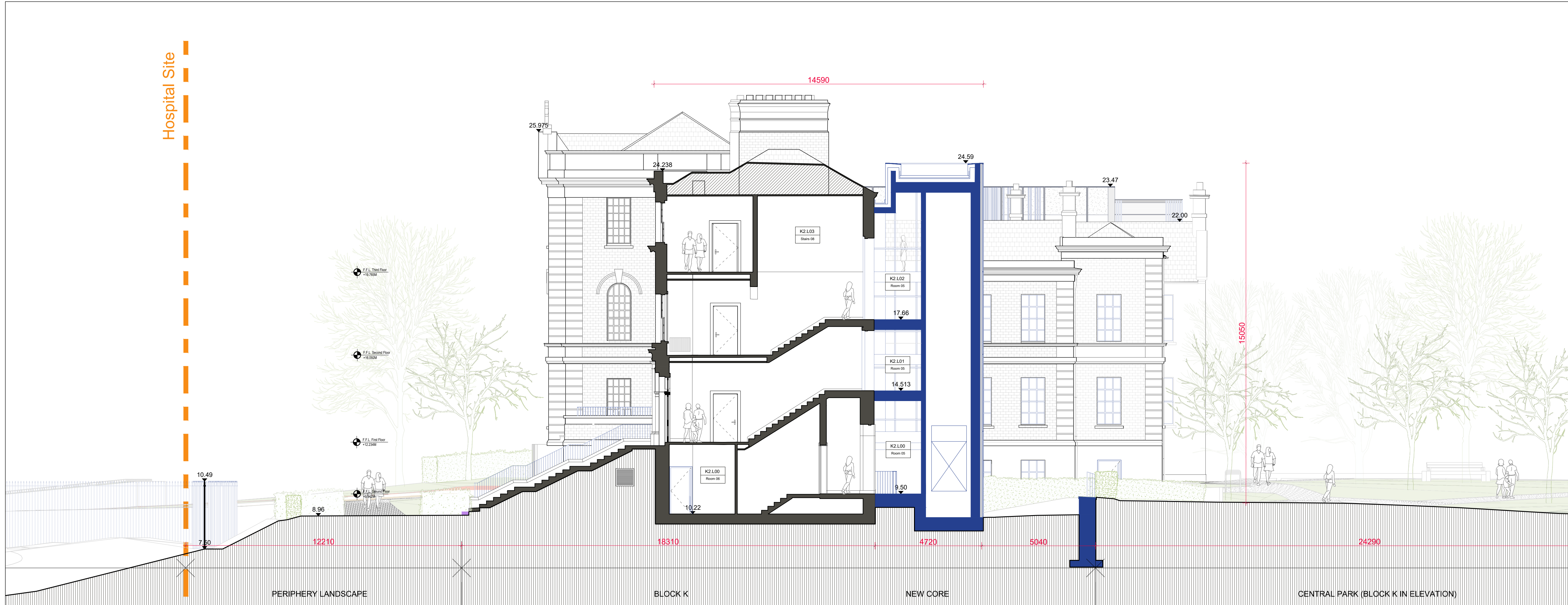
01 Section G Proposed SCALE 1:100