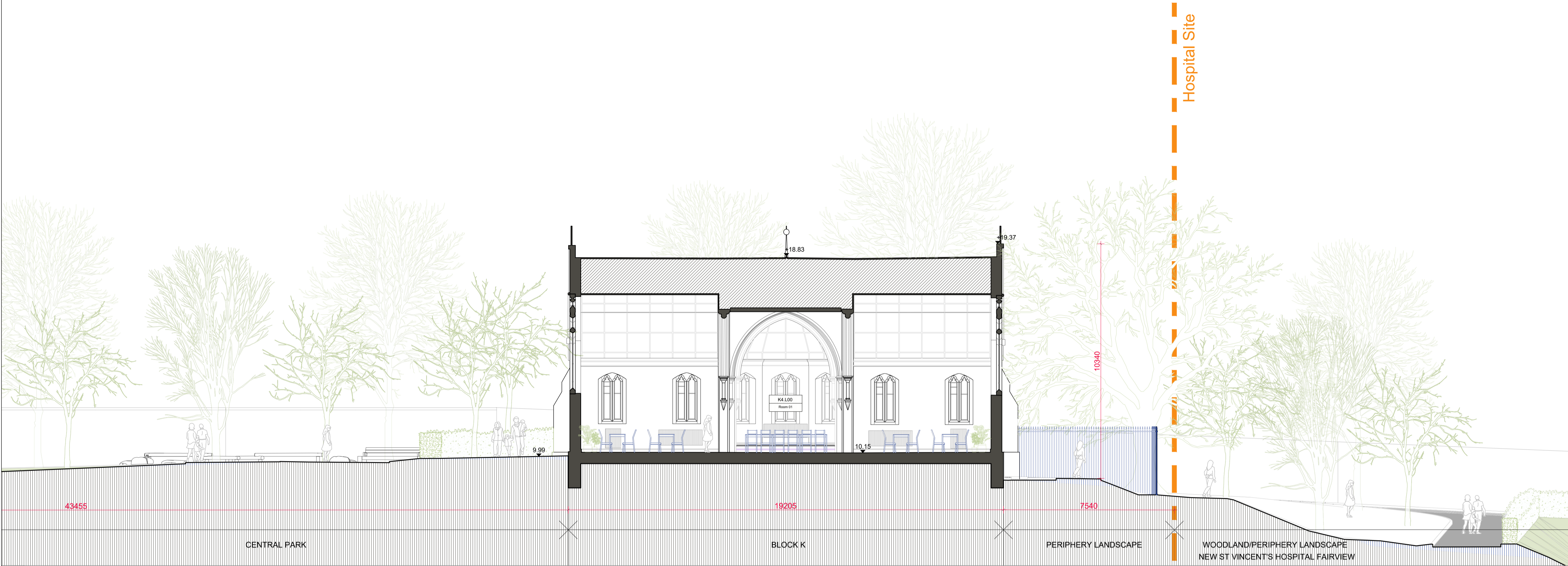
01 Proposed Section J SCALE 1:100