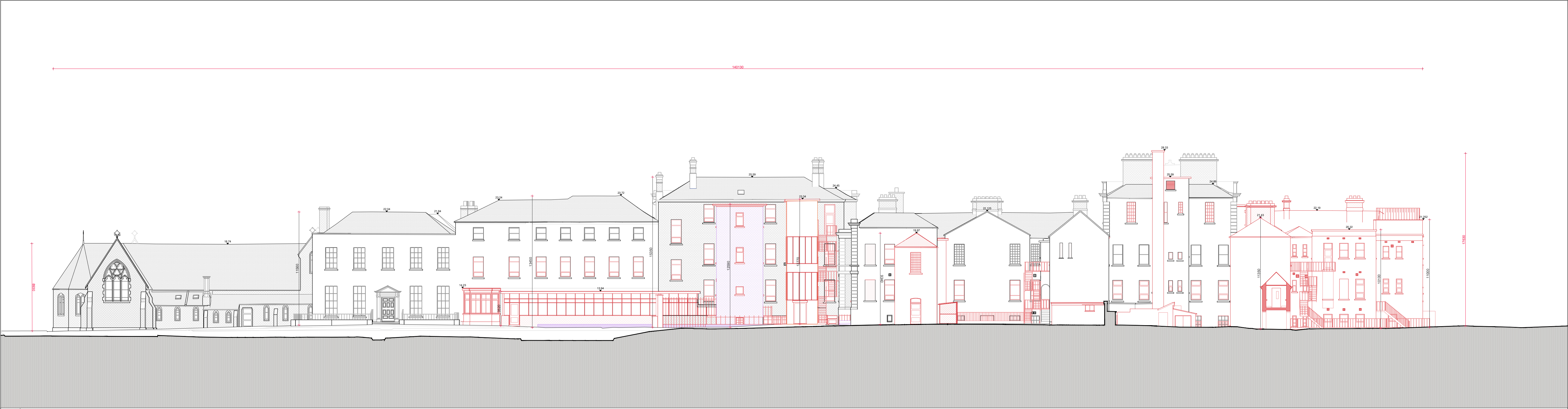
01 North Elevation Demolition SCALE 1:200