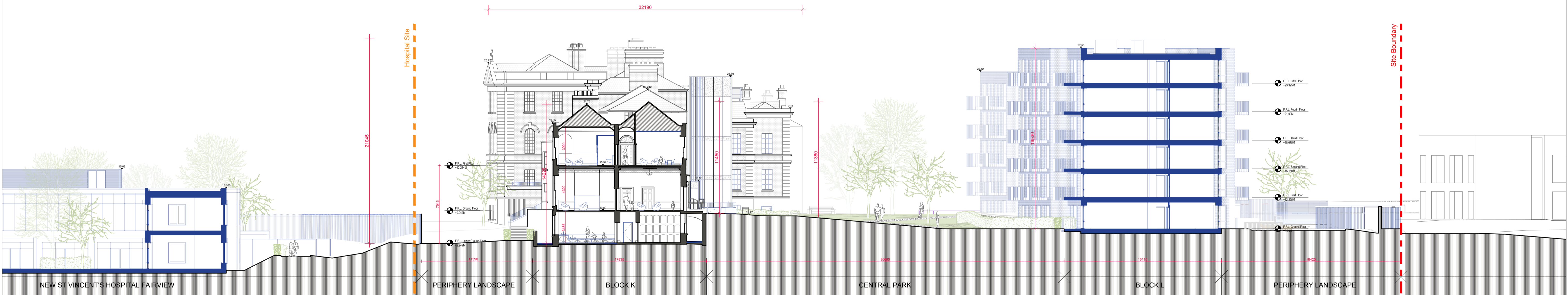
02 Section I-I Proposed SCALE 1:200