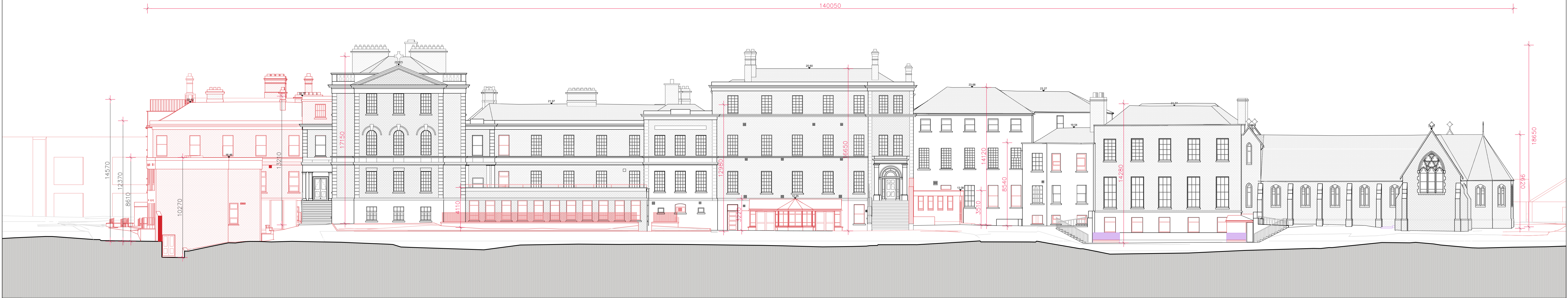
01 South Elevation Demolition SCALE 1:200