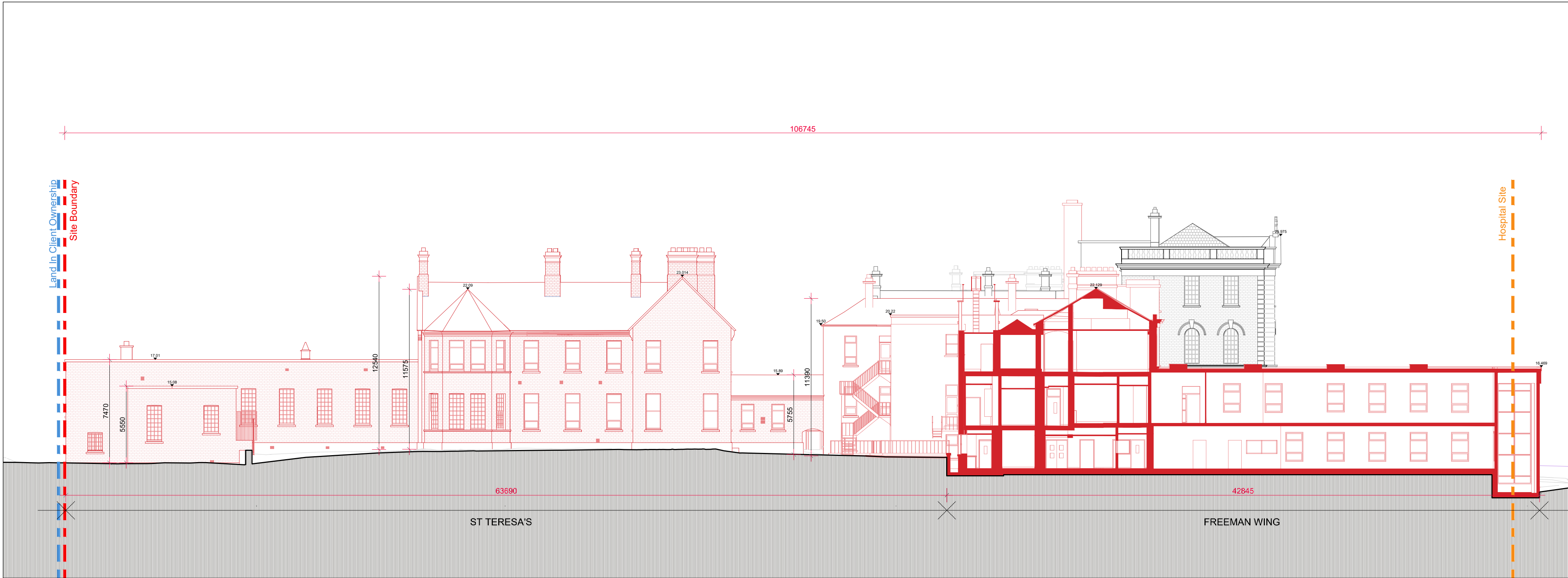
01 West Elevation Demolition SCALE 1:200