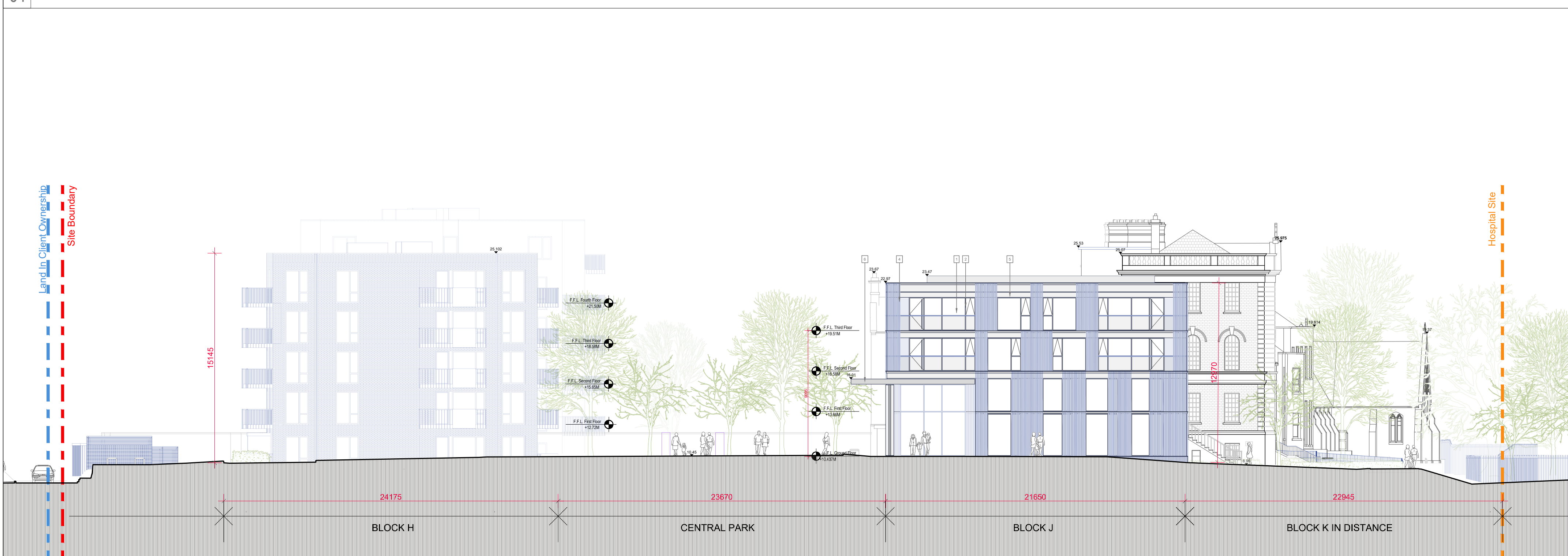
03 West Elevation Proposed SCALE 1:200