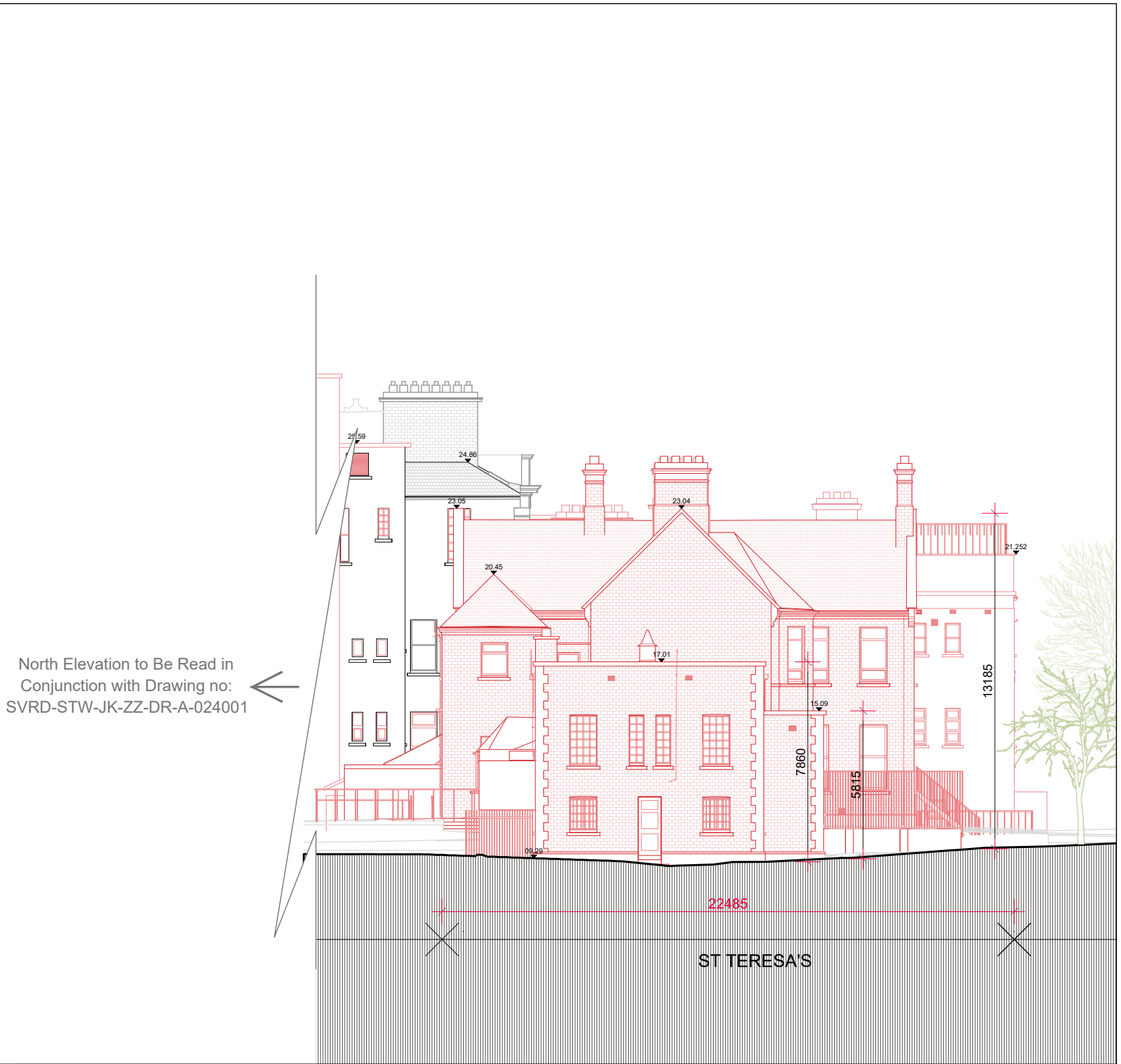
02 North Elevation Demolition SCALE 1:200 St Teresa's