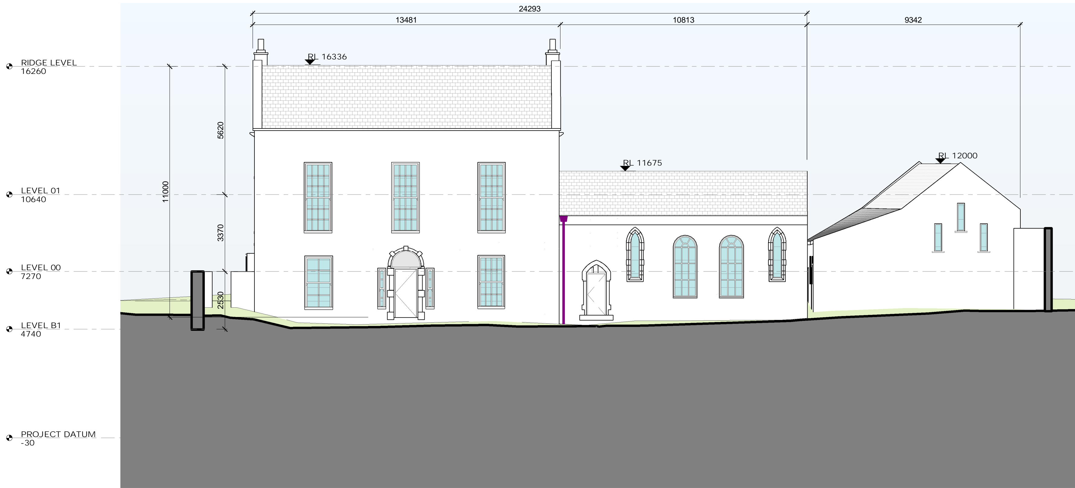
1 RICHMOND HOUSE, NE ELEVATION - GA SCALE: 1 : 100