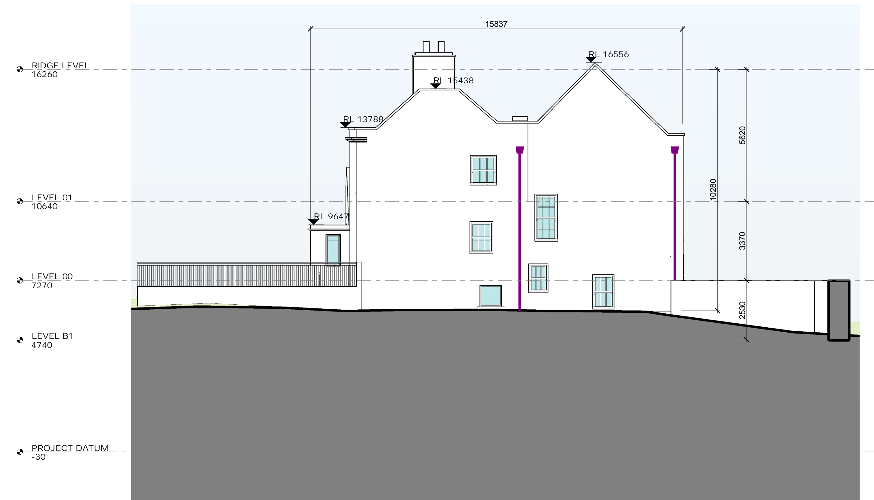
1 RICHMOND HOUSE, SE ELEVATION - GA SCALE: 1 : 100