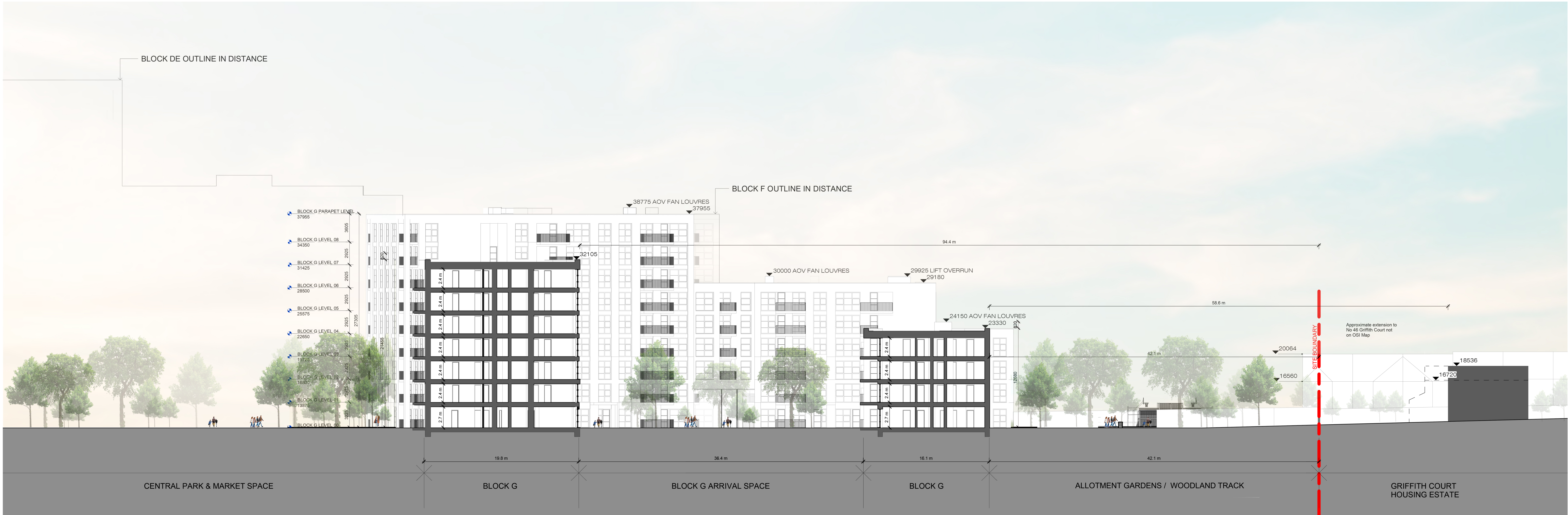
8 Site Section 8-8 SCALE: 1:200

Copyright. All Rights Reserved. This work is copyright and cannot be produced or copied in any form or by any means (graphic, electronic or mechanical including photocopying) without the written permission of the originator. Any copying, copying or implied, to use this document for any purpose whatsoever is restricted to the terms of the agreement or implied agreement between the originator and the receiving party. Levels and contours are relative to an Ordnance Survey Datum Figured dimensions in millimetres.