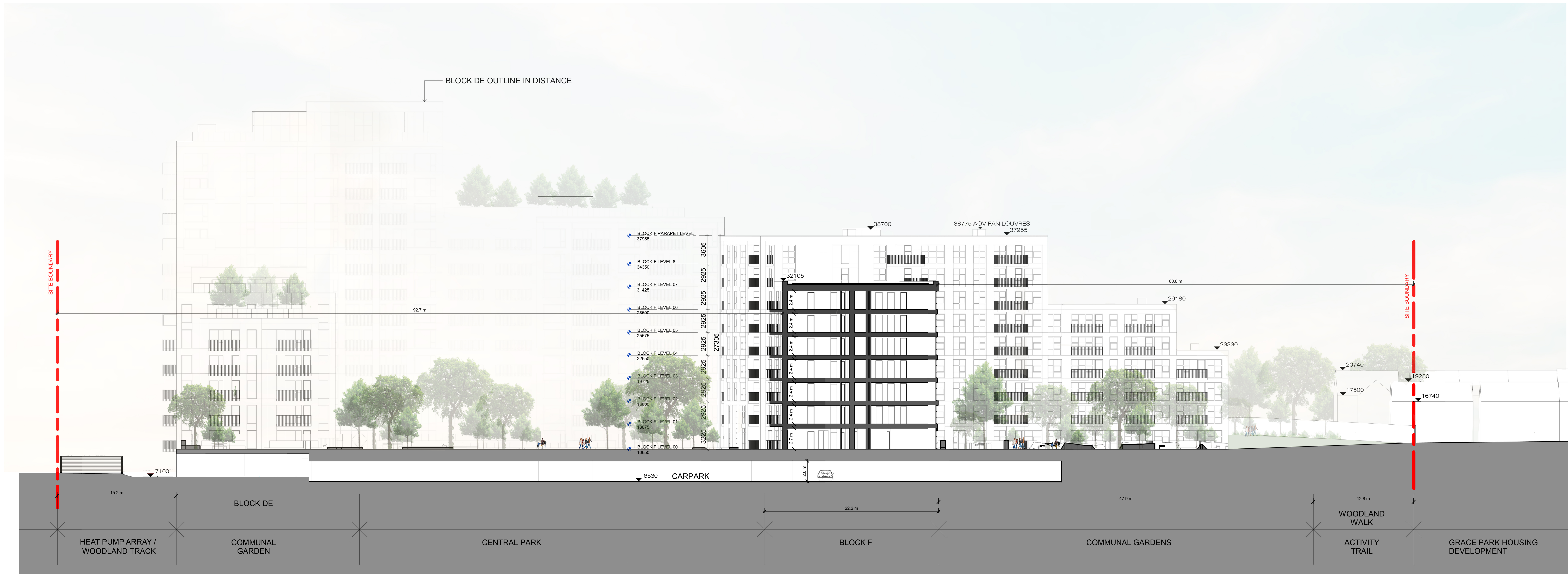
7 Site Section 7-7 SCALE: 1:200