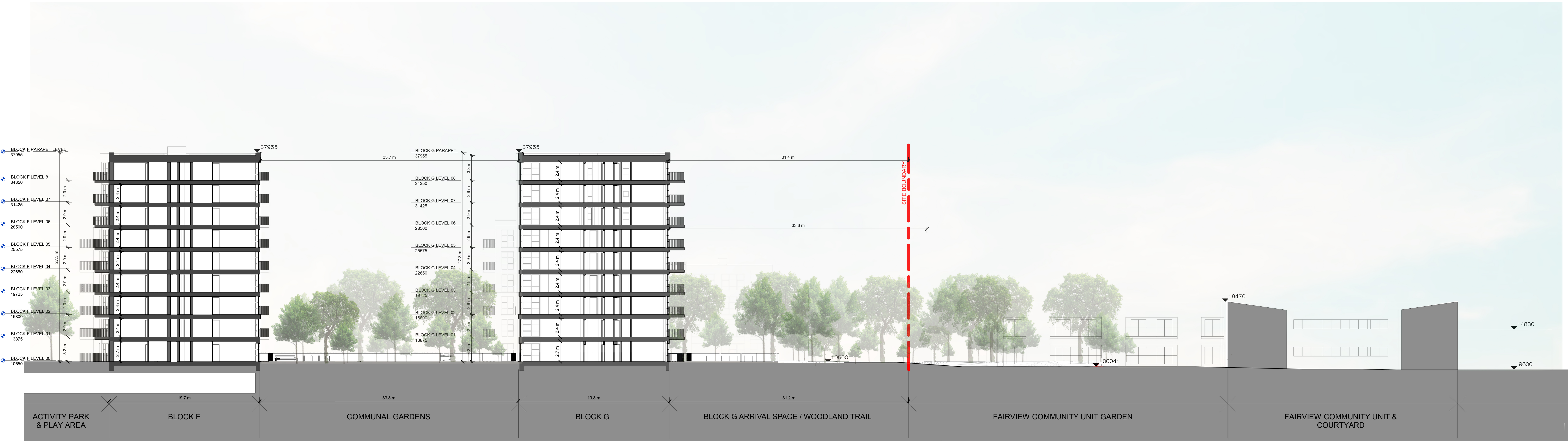
9 Site Section 9-9