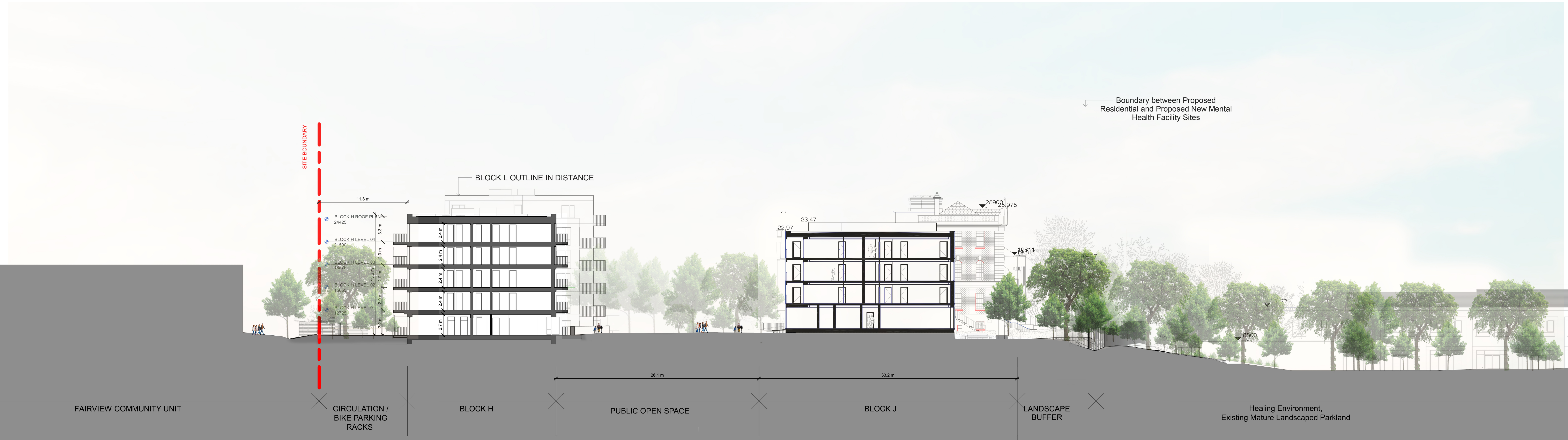
10 Site Section 10-10