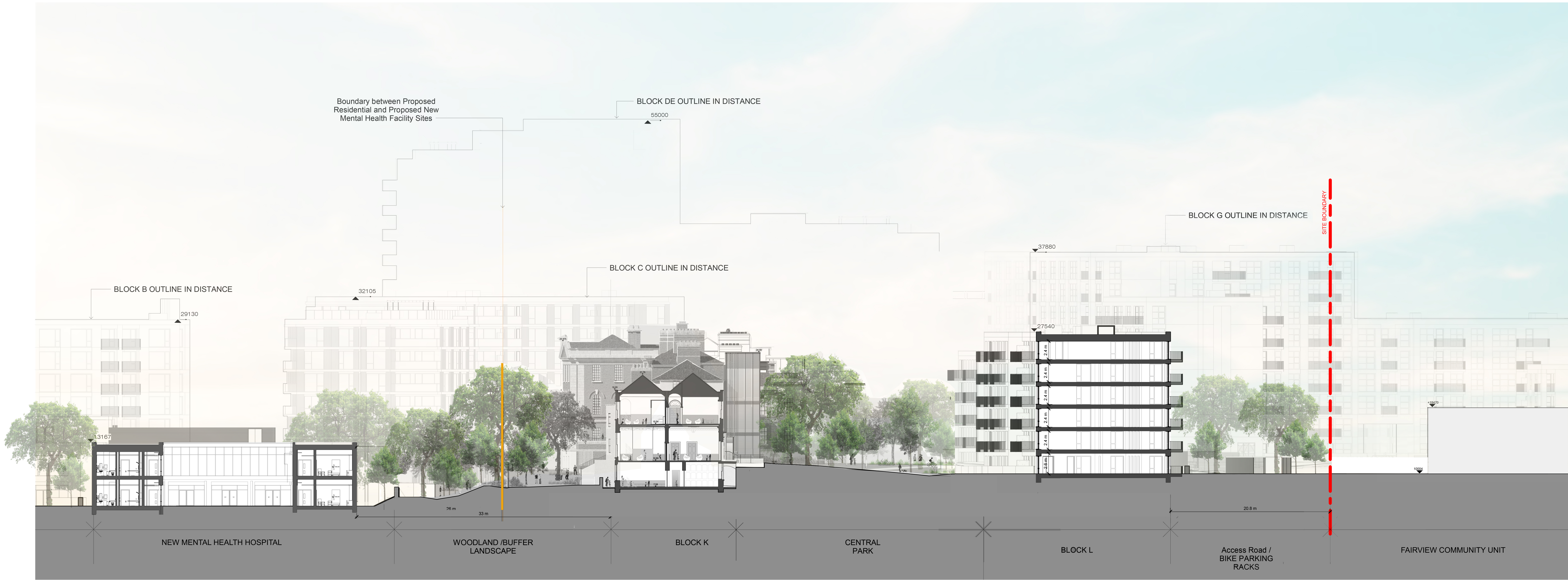
11 Section 11-11