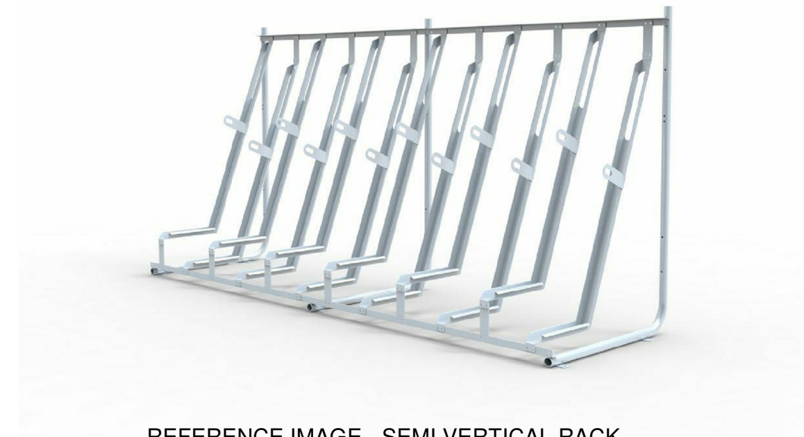
REFERENCE IMAGE - SEMI VERTICAL RACK