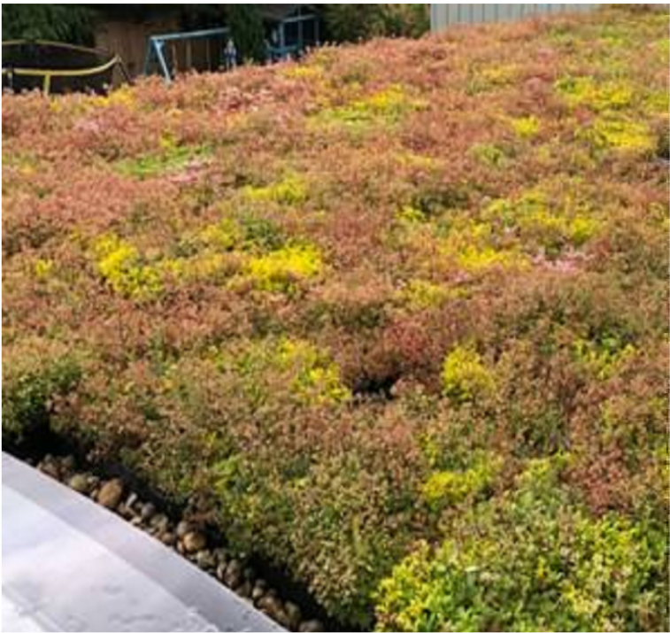
REFERENCE IMAGE - SEDUM ROOF