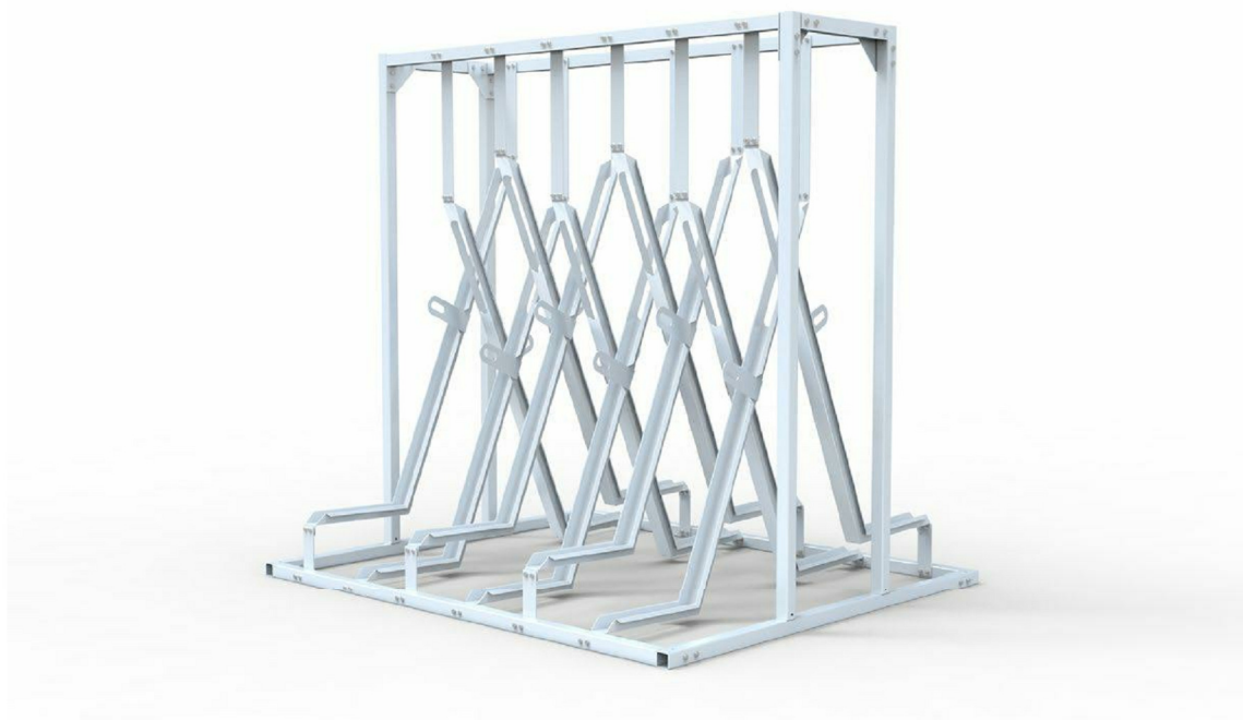
REFERENCE IMAGE - VERTICAL RACK