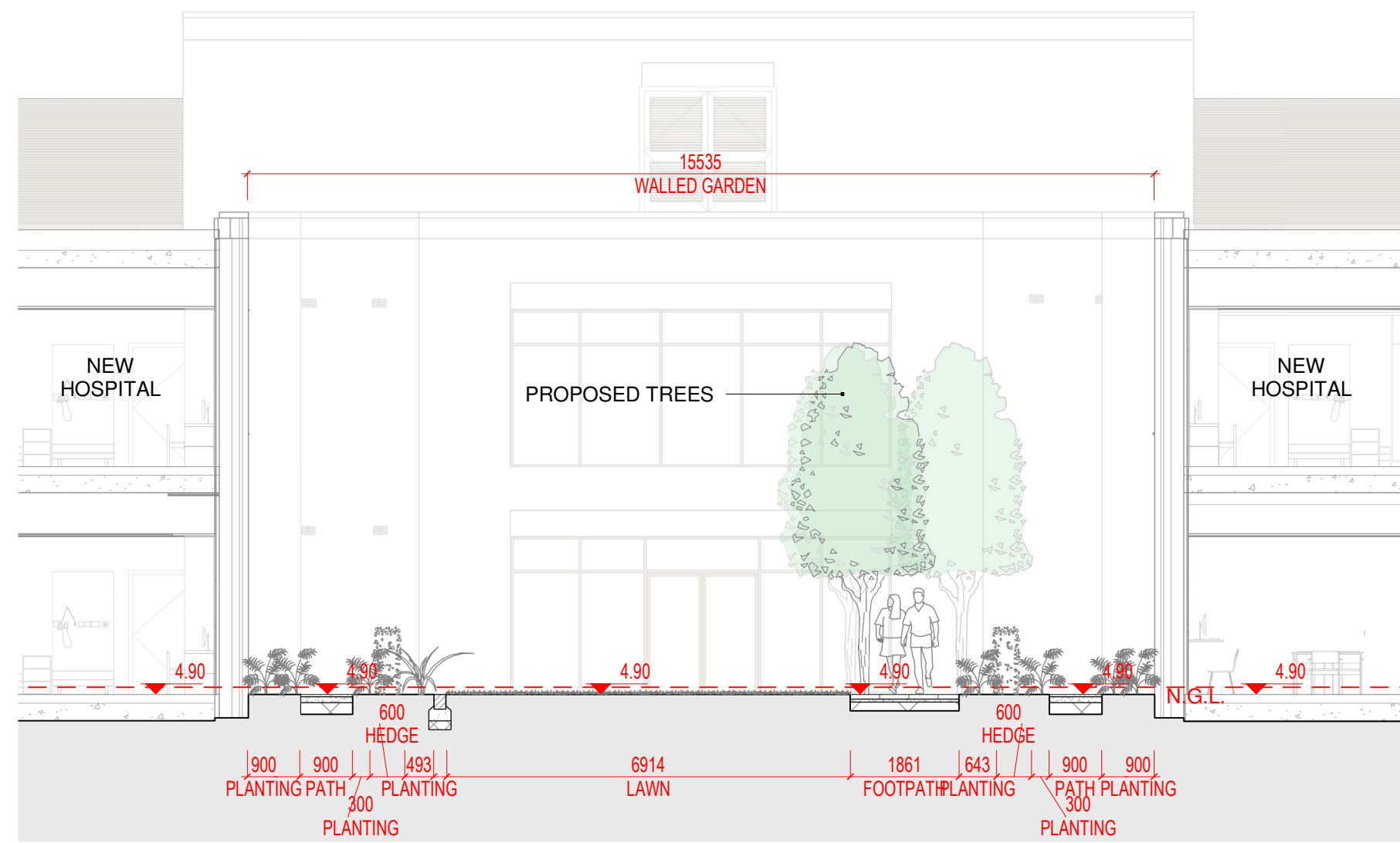
43 SECTION 43 SCALE: 1 : 100 @A1