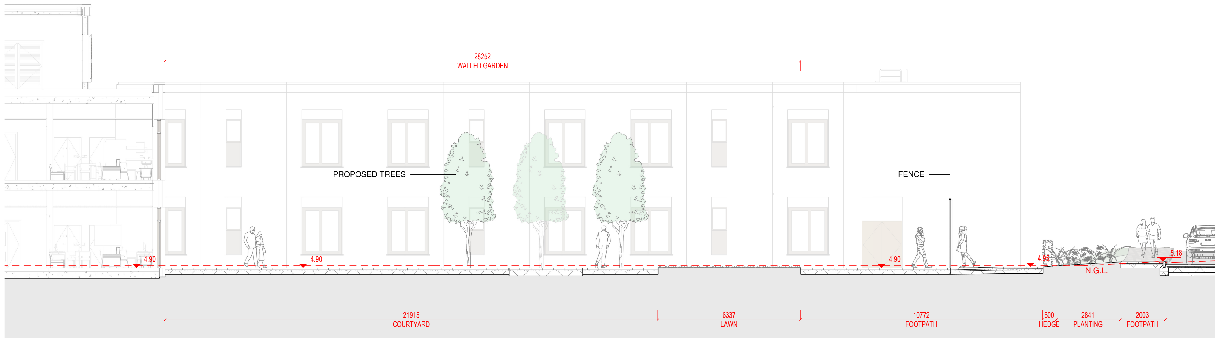
42 SECTION 42 SCALE: 1 : 100 @A1